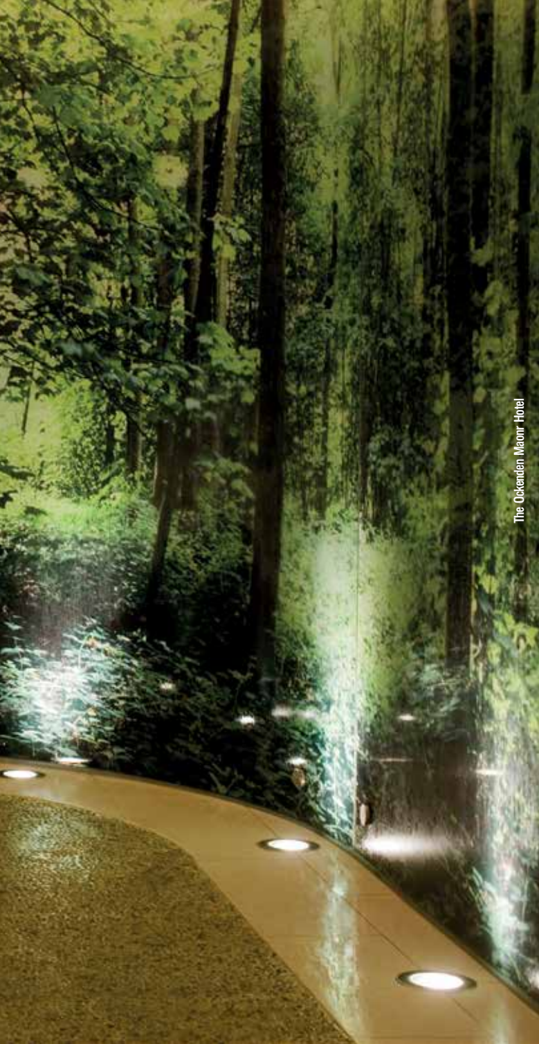
The Ockenden Manor Hotel