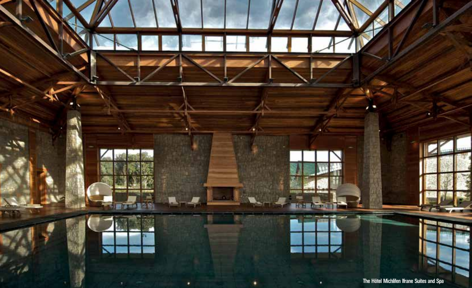
The Hôtel Michlifen Ifrane Suites and Spa

been extremely busy, acknowledge that she is probably feeling extra stress from being overworked and then offer to upgrade her session to 90 minutes at no additional cost. Let her know how important it is to relax and unwind.