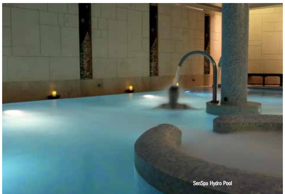
SenSpa Hydro Pool